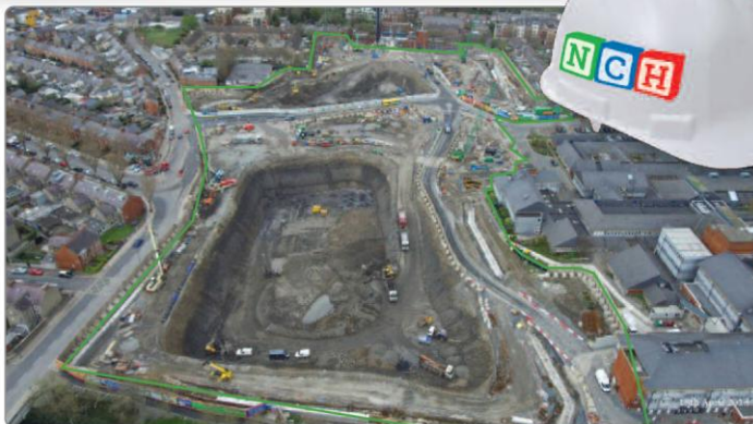
▲ WORKS PROGRESSING WELL AT THE SITE OF THE NEW CHILDREN'S HOSPITAL, ST. JAMES'S CAMPUS

We would like to take this opportunity to especially thank residents living close to the site of the new children's hospital for their continued patience and support. Should residents have any enquiries in relation to the construction of the new children's hospital please do not hesitate to contact the Residents Helpline on 01 531 1110 / info@bamcontractors.ie