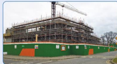
▲ ENTIRE CONCRETE STRUCTURE SUBSTANTIALLY COMPLETE AT THE PAEDIATRIC OUTPATIENT AND URGENT CARE CENTRE AT CONNOLLY

Works at Tallaght are also progressing with Decant & Crèche works scheduled to be completed in mid-2018. Main works on the Paediatric Outpatients & Urgent Care Centre is expected to commence in September 2018. The Paediatric outpatient and urgent care centre at Tallaght Hospital will be operational in 2020.