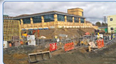
▲ DECANT WORKS AND SERVICE DIVERSIONS UNDERWAY AT THE PAEDIATRIC OUTPATIENT AND URGENT CARE CENTRE AT TALLAGHT